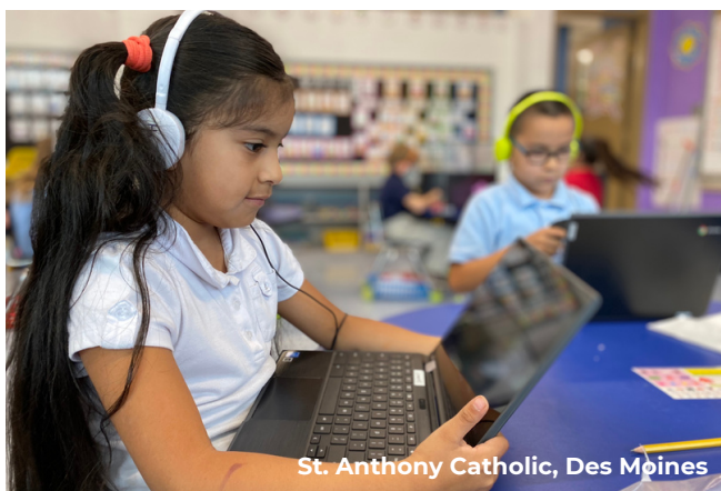
St. Anthony Catholic, Des Moines

This funding was made possible through Iowa's Computer Science Fund (CSF). The goal of the CSF program is to provide startup funds for K-12 schools in Iowa to support the purchase of an approved computer science curriculum, aligned professional development for teachers, equipment, and teacher stipends and substitute pay. Ultimately, this grant program will build the capacity of Iowa schools to provide high-quality computer science instruction.