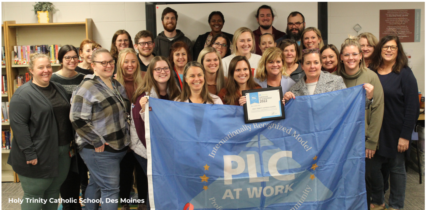
Holy Trinity Catholic School, Des Moines